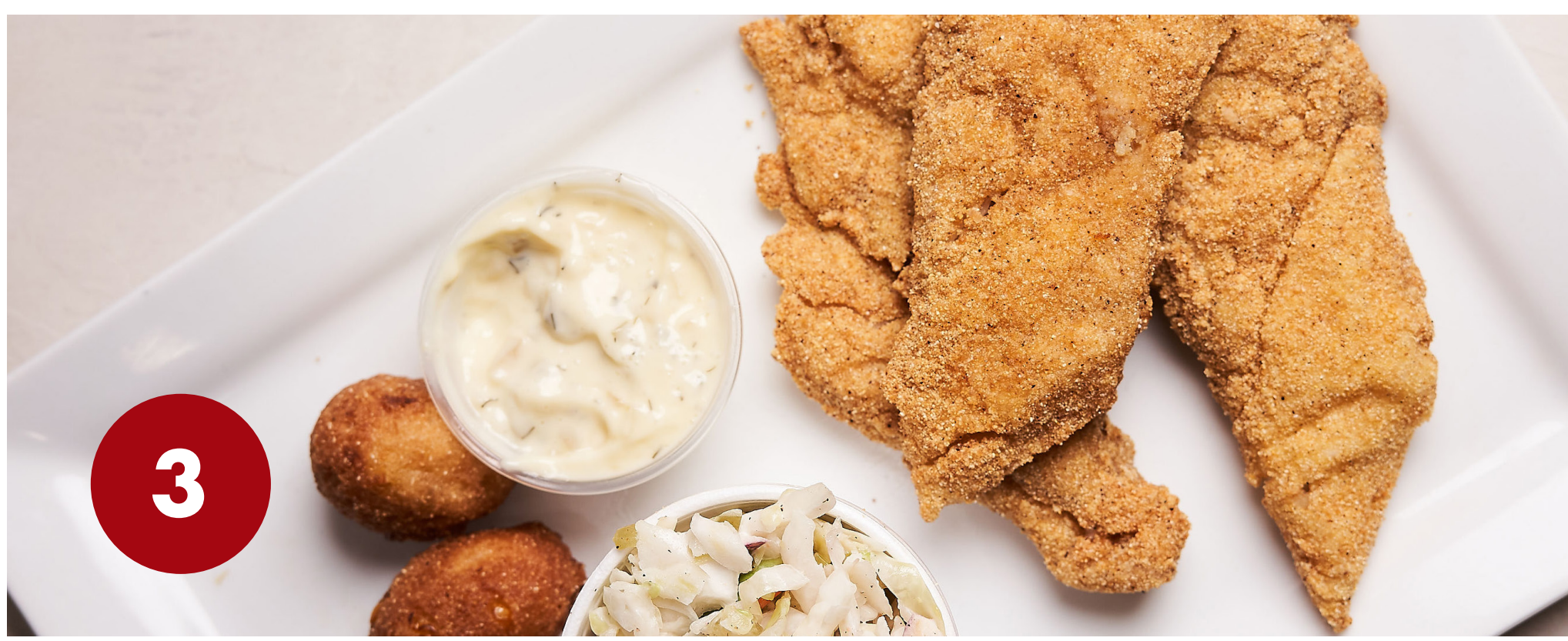
2 PC PANTROUT 9.99