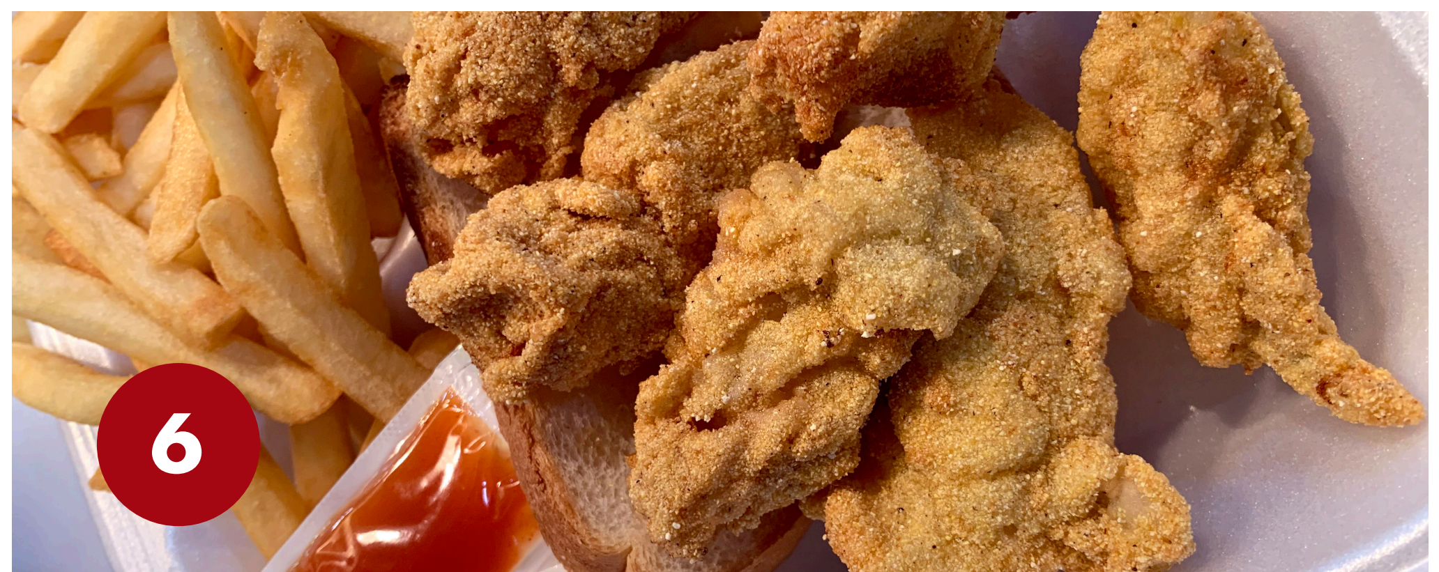
6 FRIED OYSTERS 11.99