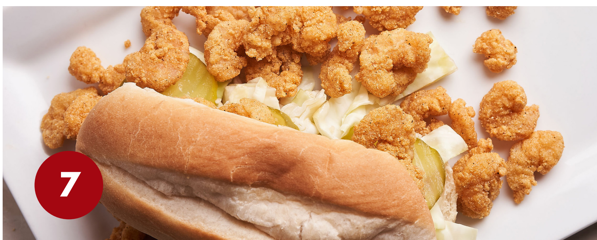
PO-BOY* 9.99 Shrimp, fish or oyster