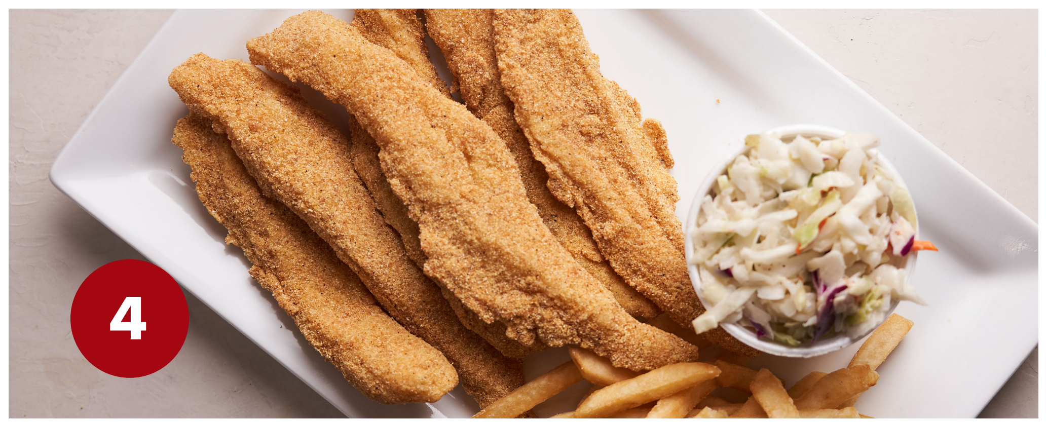
5 FISH STRIPS 9.99