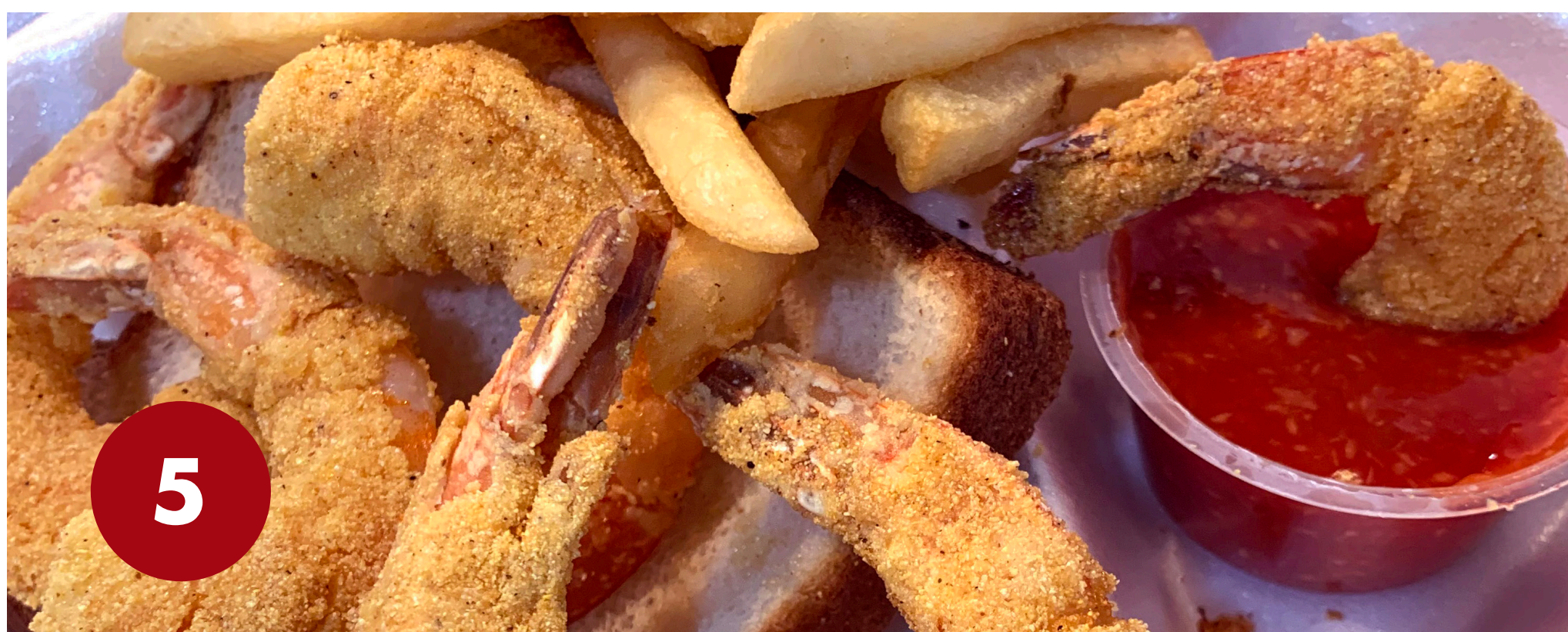
6 JUMBO SHRIMP 10.99