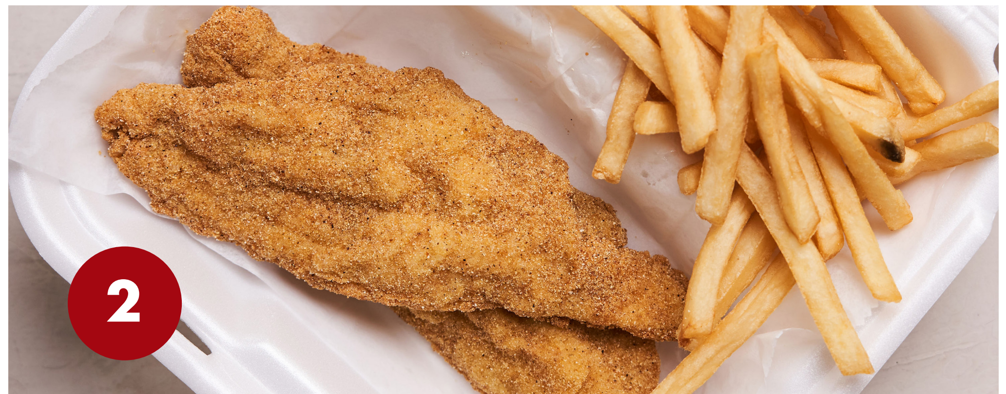
2 PC CATFISH FILET 9.99